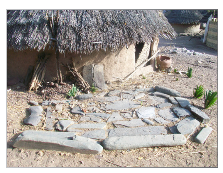
Fig. 2. Well-maintained and protected sacred site in the village of Andiel, Bedik country (Kédougou Region).

tional companies continue to destroy multiple archaeological sites situated within or near their projects.