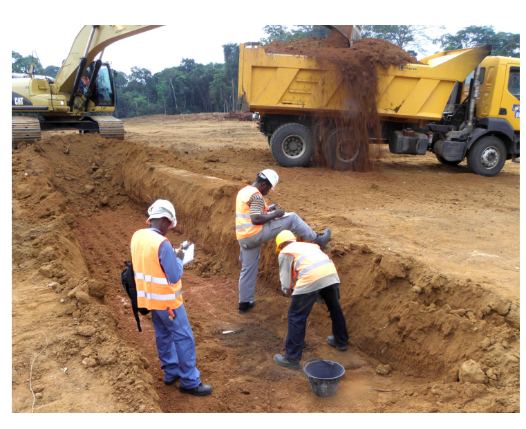
Fig. 2. Mpolongwé: discovery of a pit (dark area) in the trench.