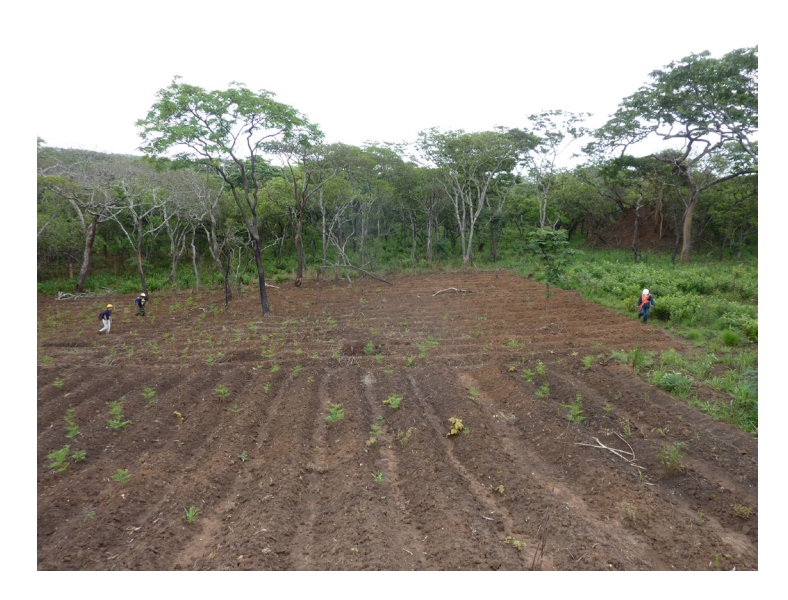
Fig. 1. Field walking along lines on ploughed ground at Tenke Fungurume in the Katanga Province of the DRC.

an induction briefing on the mining concessions' rules and regulations concerning security, driving, and other safety issues. When working in Tenke Fungurume in the Katanga Province of the Democratic Republic of the Congo (DRC), which boasts the country's biggest copper and cobalt mining operation, our team was assigned to the mining company's environmental unit. We reported to the unit's executive manager on a daily basis in order to keep him up-to-date on our progress while they assisted us with all sorts of logistical issues. We were also in contact with the mining company's social unit as they advised us on the mining concession's local authorities and helped us in setting up meetings with them and the communities. In the absence of a base camp or any other logistical assistance by the contracting authority, the team is faced with issues of car rental, petrol, accommodation and food, which we experienced for the EIA study of the Lom Pangar hydroelectric project in Cameroon.