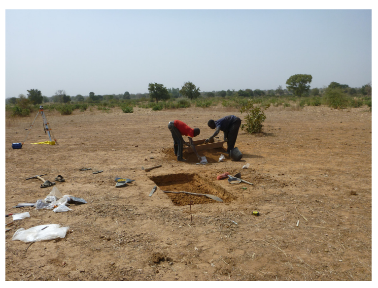
Fig 2. Sieving of sediments at a site under excavation, site Alibori 2, Northern Benin.

In addition, the student must design forms for recording information on sites located during survey and on artefacts collected during excavations, and for laboratory analysis of data. Students should also have excavation notebooks in which to record comments and impressions, which will help interpretation during the ground analysis of results.