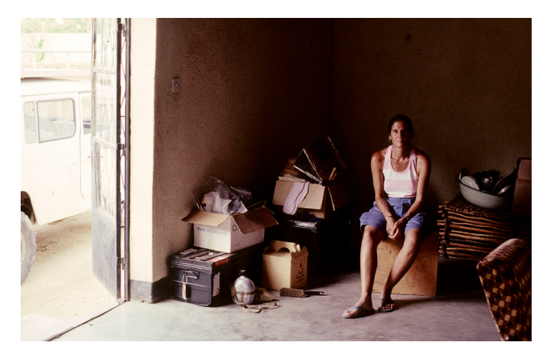
Fig. 4 . Leaving Mokolo in 1990 at the end of the first Cameroonian phase of the Mandara Archaeological Project.

god. We parted on reasonably good terms. Learning another's culture requires both sensitivity and a willingness to take risks.