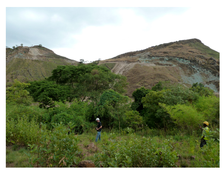
Fig. 2 . First field survey at Tenke Fungurume (DRC) during the month of December, showing extensive vegetation cover (and copper deposits in the background).