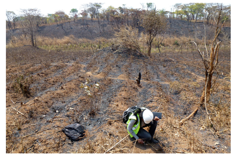
Fig. 3. Second field survey at Tenke Fungurume (DRC) during the month of September after human-induced fire for slash-and-burn agriculture. Even though overall visibility was better than during the first field season, the blackened ground tended to conceal archaeological remains.