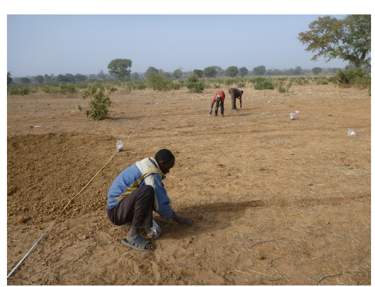
Fig. 4. Surface collection at site Alibori 2 (Northern Benin) by workmen and students.

done through a web portal, <sup>13</sup> in language specific to the organisation, and signed paper copies are often also required. This can cause problems if a team member is in the field without a good Internet connection, or if there is no team member familiar with the official terminology. Donors are nevertheless aware of the need to maintain a balance between the obligation to justify the use of public funds and the need not to crush researchers under the weight of administrative requirements<sup>14</sup>.