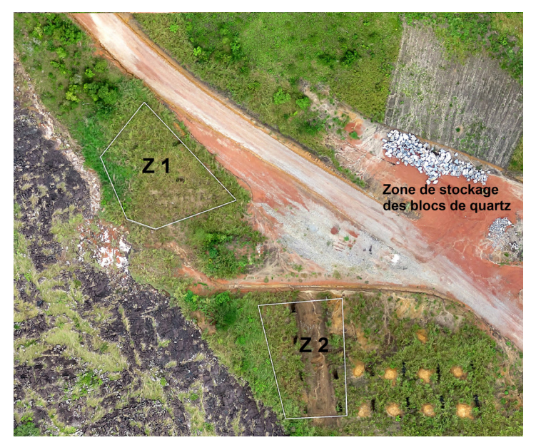
Fig. 4. Mikaka: aerial view of protected zones Z1 and Z2; the rectangles correspond to boreholes made during the diagnostic phase (adapted from COMILOG by R. Oslisly.)

excavated (fig. 3). During this work, 50 archaeological structures were discovered: 37 pits, 12 archaeological levels and a forge. Material remains (392 kg) included flaked stone, pottery fragments, earthenware, remnants of metallurgical activity (iron tools), beads, and glass.